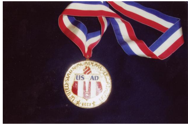
The Academic Decathlon Medal--- A Medal of Honor!!