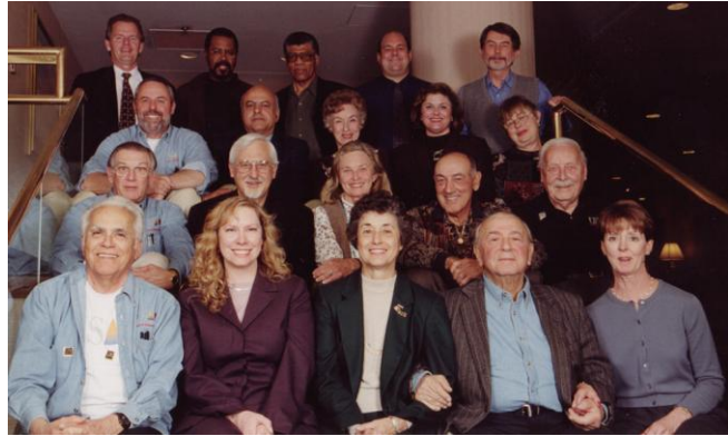
USAD Board of Directors at the National Competition in San Antonio, Texas in 2000.