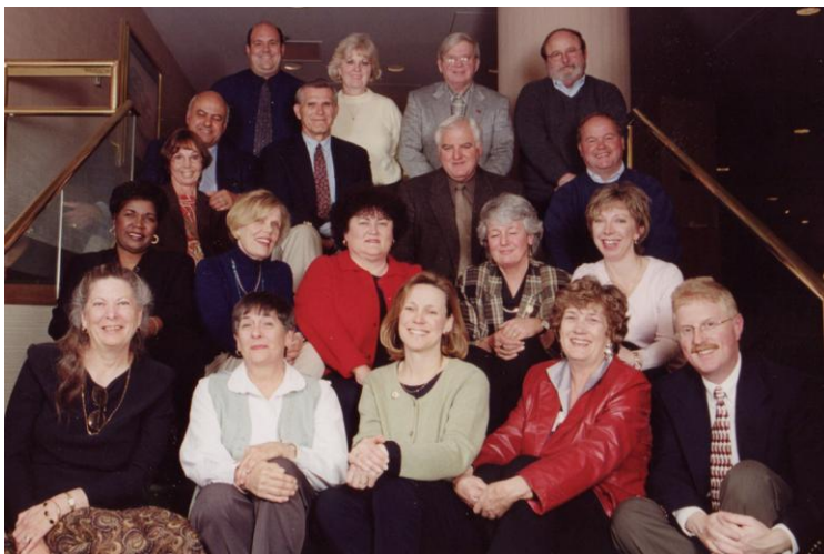
Pictured are the United States Academic Decathlon State Directors at the National Competition in 2000 in San Antonio.