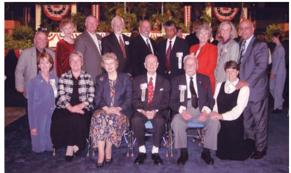
USAD Board of Directors in Erie, Pennsylvania in 2003.

Upon the advice of the Field Committee, a procedures manual was developed for the USAD National Competition in 2003. The manual was designed to serve as a guide for those involved in the planning and administration of the USAD National Competition. It listed the responsibilities of the host state and the competition coordinator. USAD and the host state would share the responsibility for all competition and contractual arrangements, including hotels and other venues, for the National Competition. The host state was responsible for organizing support at the local level, including volunteers, judges, transportation, entertainment and social events. The recommendation that USAD rotate the location of the National Competition to different geographic areas was implemented in 2003.