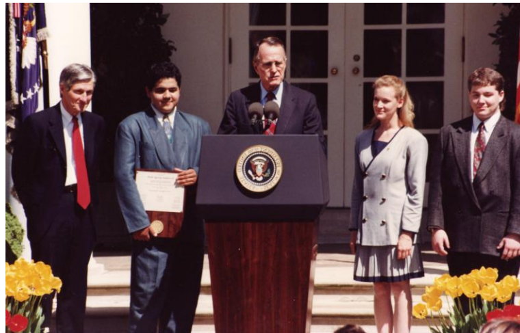
National Winners from Texas visit President George Herbert Walker Bush at the White House on April 23, 1992.