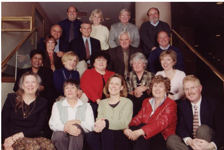
Pictured are the United States Academic Decathlon State Directors at the National Competition in 2000 in San Antonio.