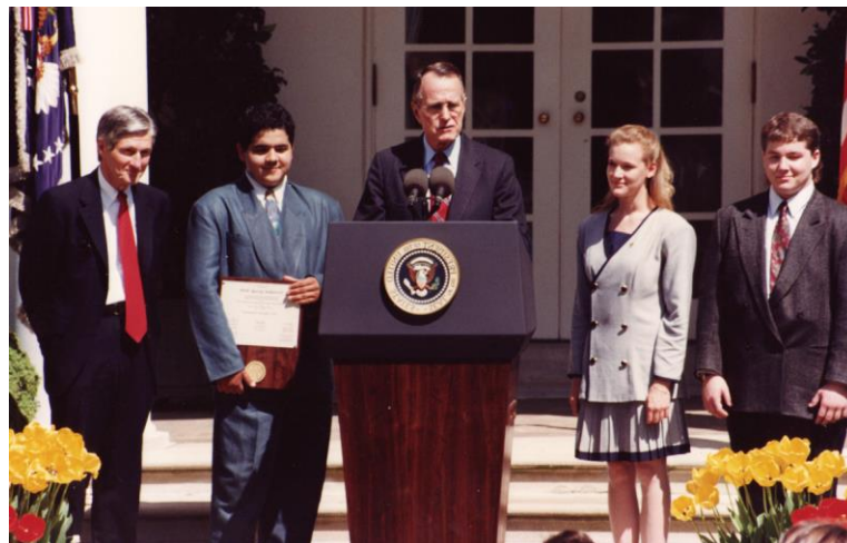
National Winners from Texas visit President George Herbert Walker Bush at the White House on April 23, 1992.