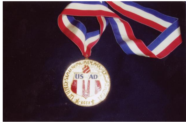
The Academic Decathlon Medal--- A Medal of Honor!!