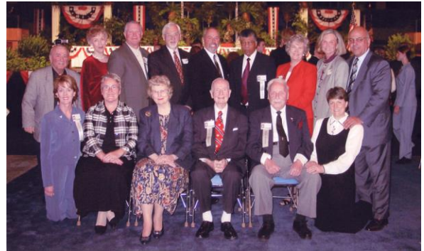
USAD Board of Directors in Erie, Pennsylvania in 2003.

Upon the advice of the Field Committee, a procedures manual was developed for the USAD National Competition in 2003. The manual was designed to serve as a guide for those involved in the planning and administration of the USAD National Competition. It listed the responsibilities of the host state and the competition coordinator. USAD and the host